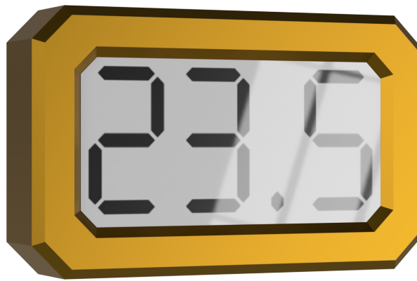
Figure 1: First Prototype

A significant challenge in the 3D mapping of coral reefs is geospatial positioning. Currently, depth and orientation data must be recorded manually by divers wearing dive computers. This process introduces the potential for measurement error, data loss, takes extra time, and separates the spatial data from the 3D maps. The Coral Tile is a tablet-like device which offers a better alternative to this process. It can be placed in the mapping area and will display relevant spatial information on a large screen, which would be recorded into the map imagery, embedding spatial data directly and permanently into the 3D maps. This new automated process forgoes the need to manually record or save data elsewhere, simplifying and speeding up the mapping process.