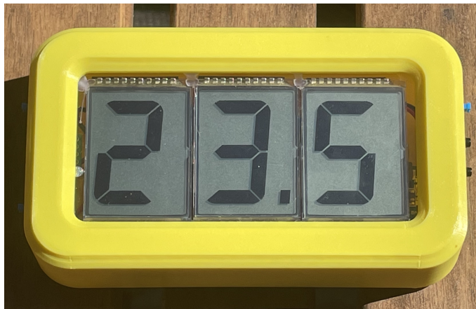
Figure 3: Development Platform

The first minimum viable product for the Coral Tile takes the form of an extensible mockup design with similar functionality (Fig. 3). This design does not include an actual sensor as it is not waterproofed, and it contains buttons on the sides to help with event triggering and mode selection. It also carries a USB plug to make programming easier. The purpose of this prototype is to enable further software development and get a feel for the product while there is no actual hardware to develop on.